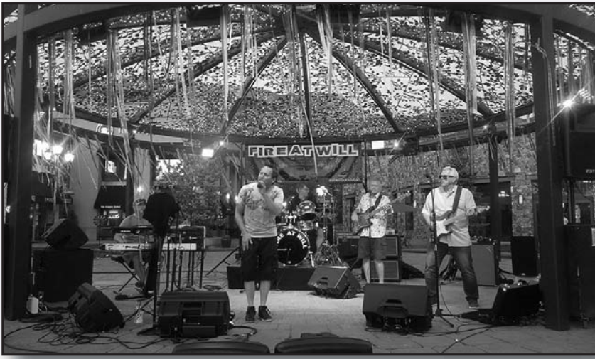
Fire at Will