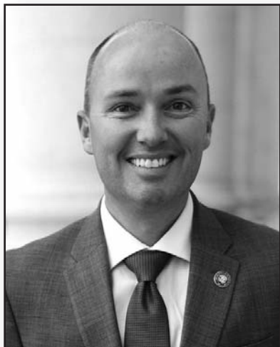
Lt. Governor Spencer Cox