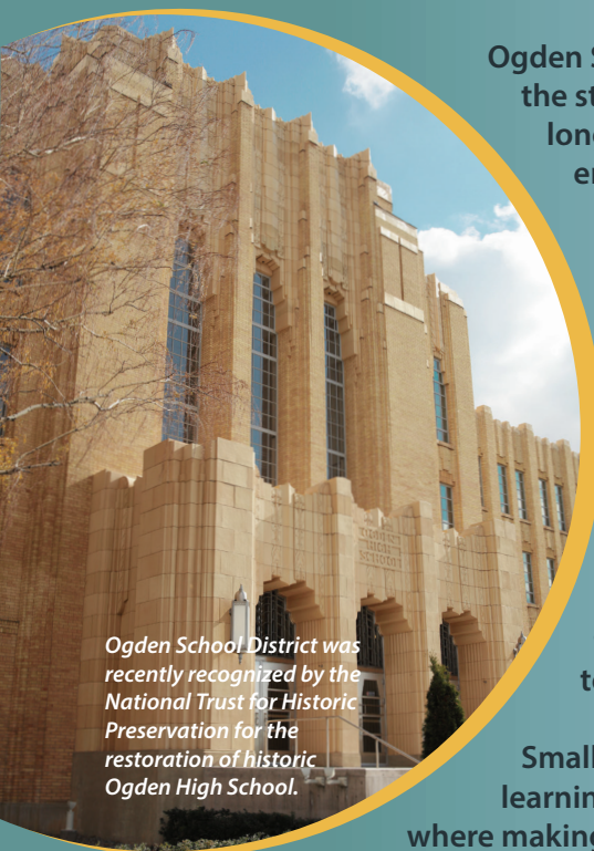
Ogden School District was recently recognized by the National Trust for Historic Preservation for the restoration of historic Ogden High School.